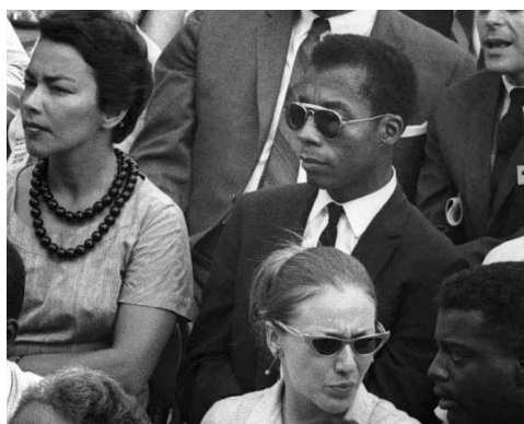
James Baldwin in the crowd. March on Washington for Jobs and Freedom, August 28, 1963, Washington D.C.